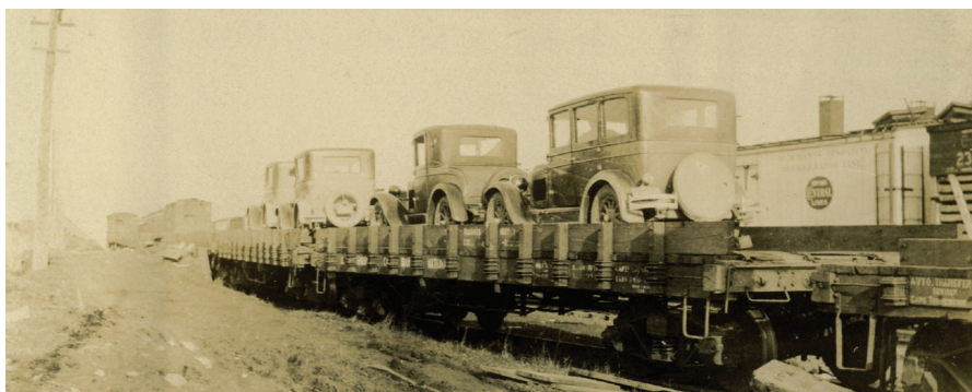
Figure 2: This detail from a 1920s postcard captures a major trend in Island tourism: the travel freedom provided by the automobile. However, until the S.S. Prince Edward Island was renovated to create an automobile deck, the only way for tourists to get an automobile to PEI was on a railway flatcar.