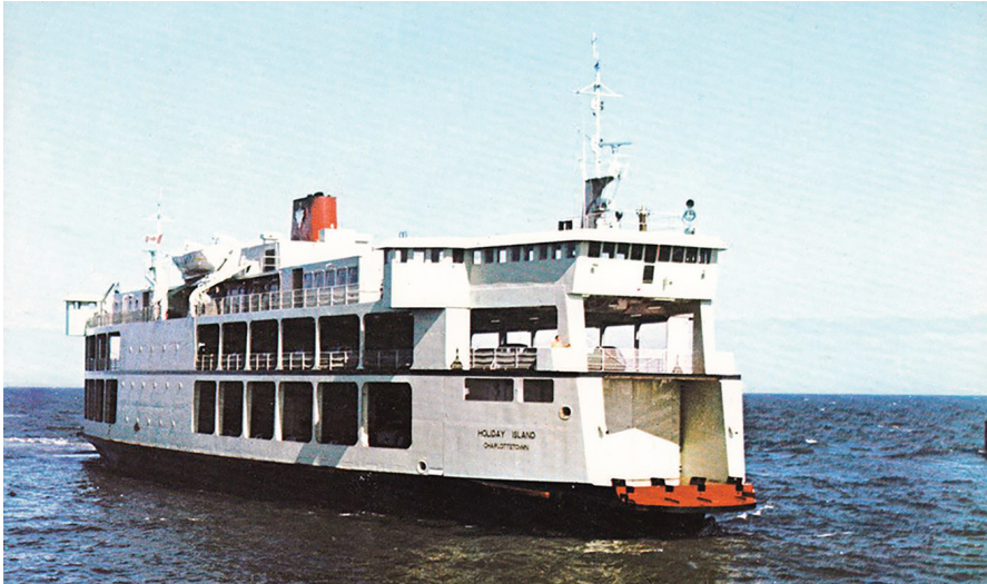
Figure 4: Beginning in 1962, “ro-ro”s – roll on, roll off ferries – were introduced for rapid loading and unloading. The names of the two so-called “hot dog” boats, Vacationland and Holiday Island (1971), reflected tourism’s dominance.

As a stopgap measure to relieve congestion, a second-hand ferry, re-named the L. M. Montgomery , was acquired in 1969. 76 In 1971, two more “ro-ro”—roll-on/roll-off—ferries were commissioned, the Holiday Island and the Vacationland . These three vessels’ names reflected their purpose: to handle summer tourist traffic (see Figure 4). Despite the augmented fleet, ferry arrangements only approached adequate when visitor numbers began to flatten out in the mid-1970s. Finally, the 250-car capacity of a massive new ferry (like its iconic predecessor, christened the Abegweit ), put an end to dolorously long ferry line-ups when it entered service in December 1982. 77 The escalating cost of replacing ferries helped direct Ottawa’s attention towards a different alternative for fulfilling its constitutional obligation to secure the rights of passage. That vision, in turn, cast the tourism merits of the crossing to Prince Edward Island in an entirely new light.