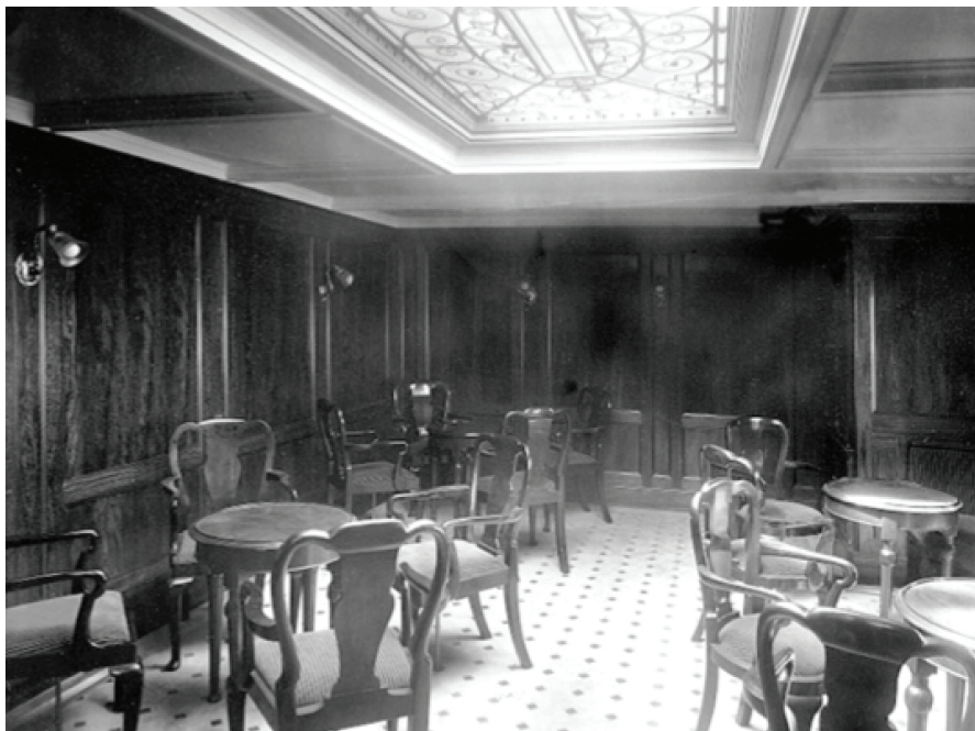
Figure 1: Smoking Room, S.S. Prince Edward Island . The vessel's elegant interior spaces suggested an ocean liner more than a ferry on a two-hour cruise.

round trips across the Strait. 22 The Mainland, it seemed, was finally within easy reach.