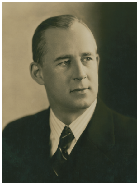
Figure 1: D.C. Harvey, Archivist for Nova Scotia, 1931.

As Harvey told Brebner, he had no doubt it was mainly “Nova Scotia’s drive for tourists” that burdened him with “racking my brains and searching the records in order to save the fair name of history from exploitation.” 9 Tourism/history ate up hours and hours of time Harvey could ill afford to lose. 10